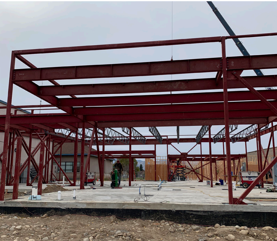
Rock Island Elemenatary has been the most complex construction project, including six new classrooms, a cafeteria and kitchen, and playground upgrades.