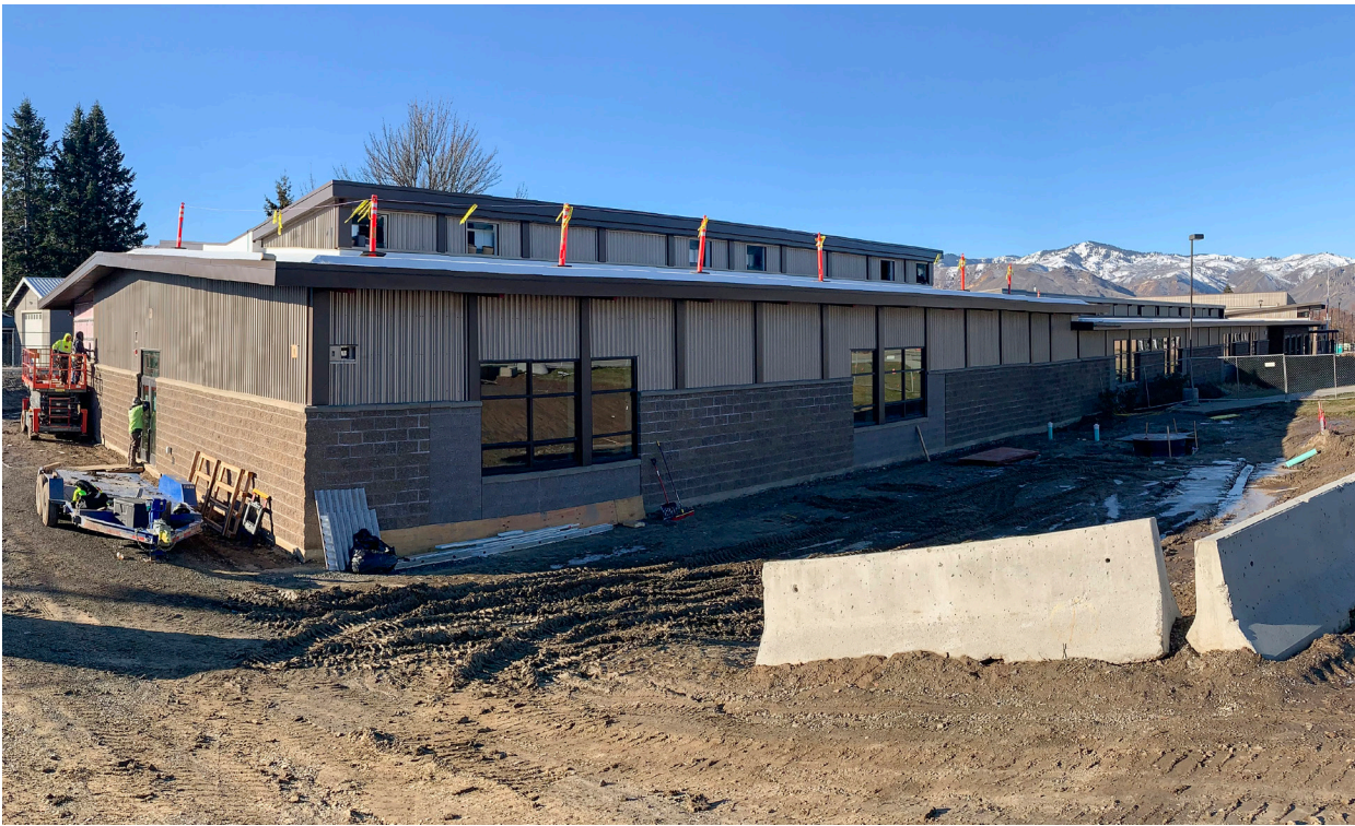
Grant Elementary's expansion and renovation is one of six construction projects nearing completion in the Eastmont School District. The projects were funded in part by the capital levy approved by voters in 2016 and a $10 million grant. All projects are currently on time and on budget.