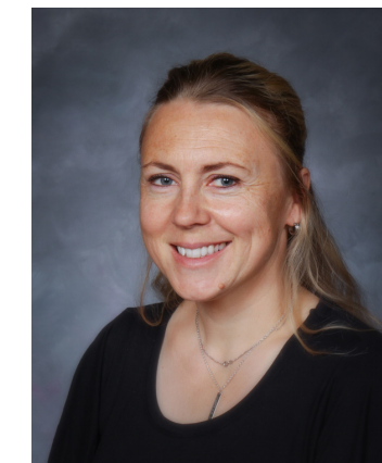
Vira Bowman Sterling Intermediate School